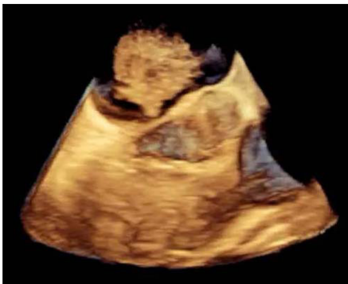
Figure 2. 3D transesophageal presentation of the tumor mass with a clear stalk which arises from the interatrial septum